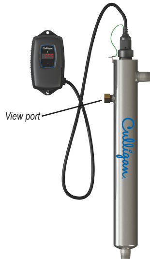
6 GPM Dimensions: 2.5"x21.3"x3/4"