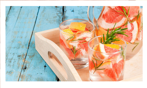
Easy DIY Detox Drinks That Will Make You Feel Energized