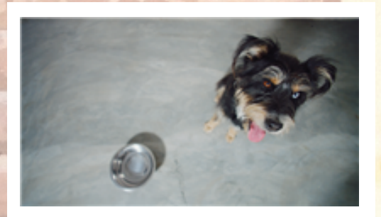
3 Hot Weather Tips To Keep Your Dog Safe This Summer