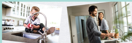
Enjoy the taste of bottle-quality water without all of the extra plastic bottles!