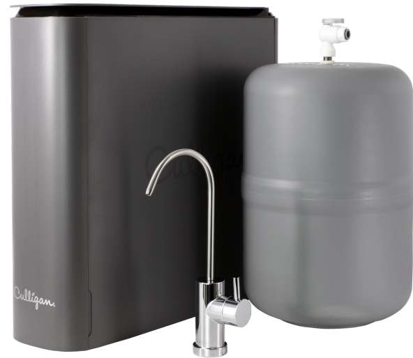
Aquasential Tanked Reverse Osmosis Drinking Water System