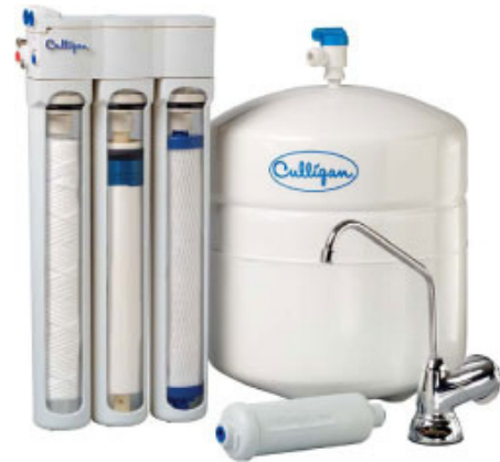
Culligan AC 30 Good Water Machine Reverse Osmosis Drinking Water System