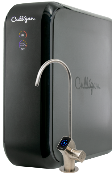
Aquasential Tankless Reverse Osmosis Drinking Water System

Just because you don't have a lot of space doesn't mean you can't have great water.